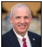
Hon. Matt Huffman