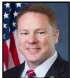
Hon. Warren Davidson